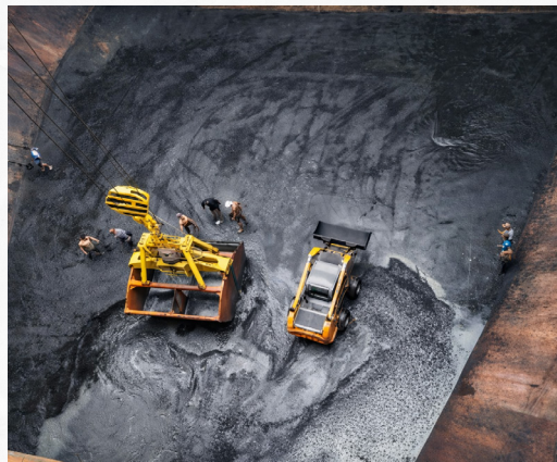
Ship's grab in cargo hatch to discharge remaining cargo