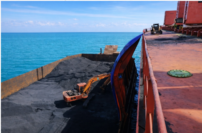
Discharging of Petroleum Coke ex M.V 'Glovis Mermaid at Teluk Ewa Anchorage, Langkawi with canvas placed between ship and barge to avoid spillage into sea