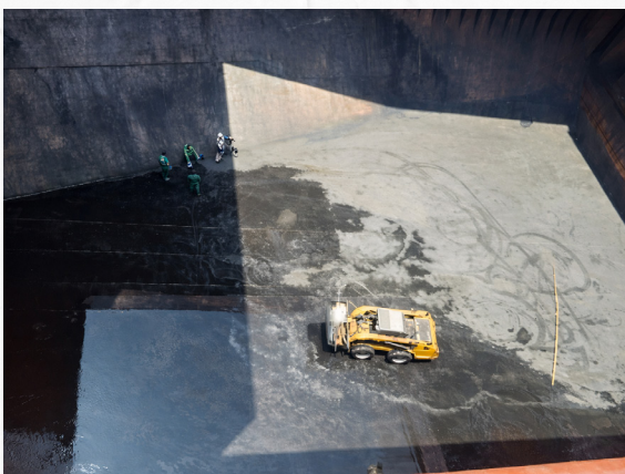
Stevedore gang utilizing bobcat for cleaning hatch upon completion of discharge